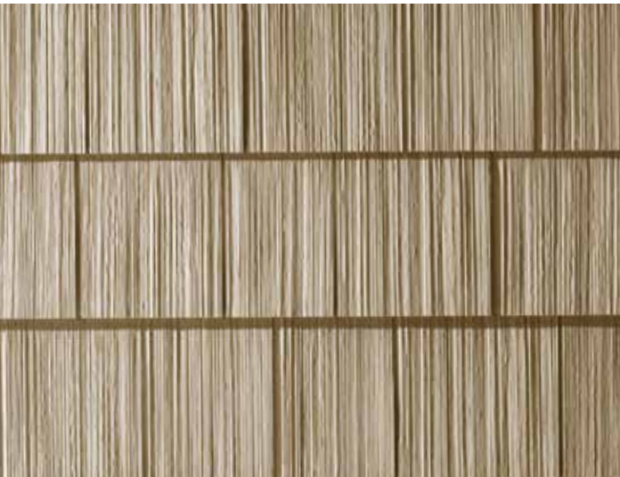
Traditional 7" shake features a remarkably authentic woodgrain texture.

There are no limits to what you can do when you imagine your perfect exterior design. From ornate and dramatic to muted and charming, customization is yours with Pelican Bay One Shakes and Scallop. Beautiful, practical, and made to last, this impressive collection features the distinctive beauty of natural-looking woodgrains without the time-consuming maintenance and costly upkeep.